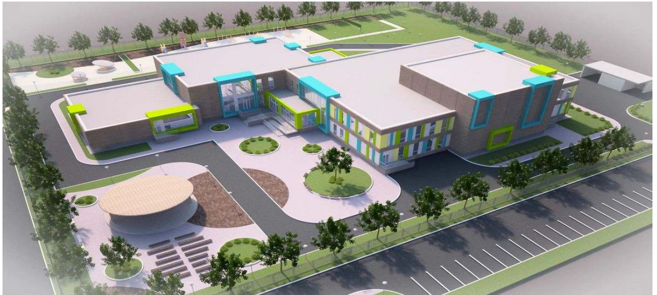
CLIENT...MEGA LIFE PROPERTY LOCATION...ASUTSURI-GHANA DESIGN OF BASIC SCHOOL COMPLEX