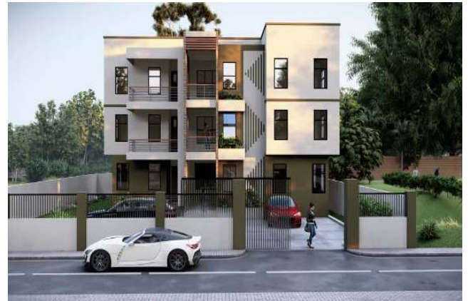
CLIENT: MR DOUGLAS ANNOR LOCATION : KPONE-G/ACCRA 2BEDROOM DUPLEX -2 STOREY PROJECT