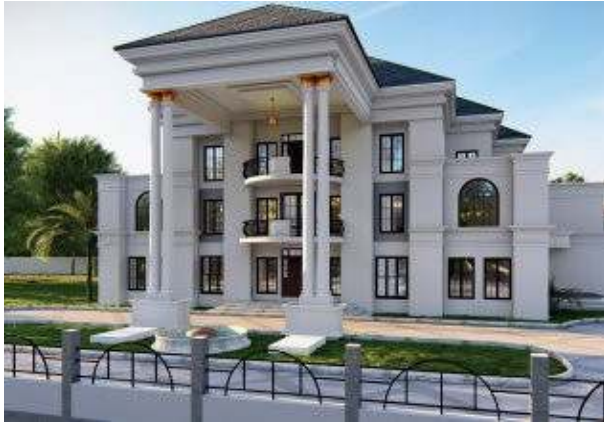
CLIENT: MR DARLINGTON LOCATION: PRAMPAM-G/ACCRA 10 BEDROOMS RESIDENTIAL PROJECT